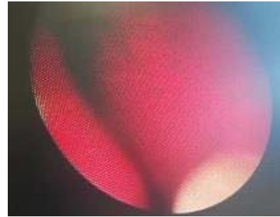
Figure 2. Deviated septum and hypertrophic turbinates