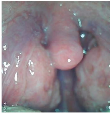
Figure 1. Enlarged tonsils